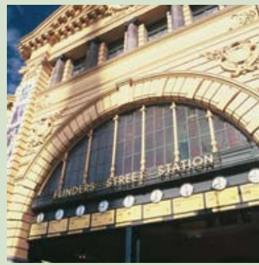
Under the clocks at Flinders Street Station

Step up to Centre Way ⑦ (1913) – an early steel-framed building with a post-modern makeover – then cross Collins Street and turn left before entering the exquisite 19th Century Block Arcade ⑧. The arcade was named after the fashionable Collins Street block between Swanston and Elizabeth Streets where nineteenth century Melburnians liked to promenade or 'do the block'. Today, it is still a hive of activity, with its mosaic floors and fascinating shops to explore.