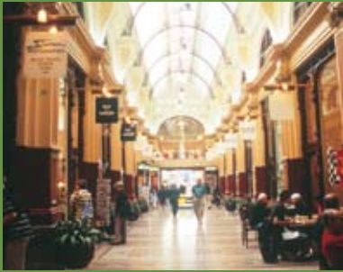
The famous Block Arcade

Reaching Melbourne's shopping heart at Bourke Street Mall (12), turn left and cross the Bourke St Mall, pass the sculpture the Public Purse (13) then continue along Elizabeth Street. The Underground Public Toilets (14) are historic: the men's were built in 1910, while the ladies waited longer, until 1927.