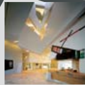
The Ian Potter Centre NGV Australia