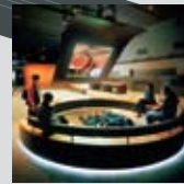
Australian Centre for the Moving Image